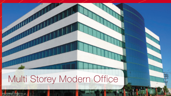
Multi Storey Modern Office