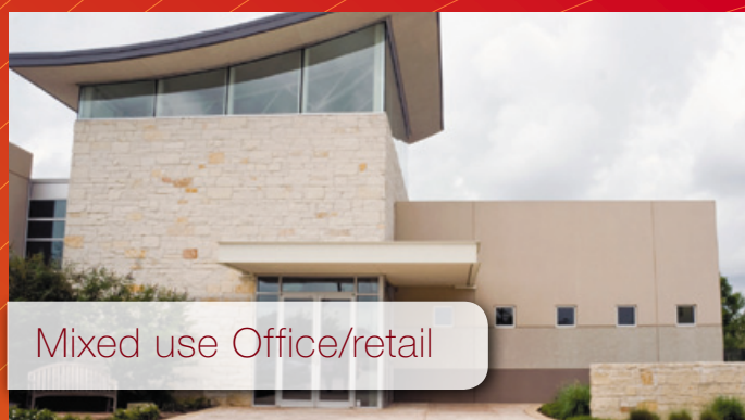
Mixed use Office/retail